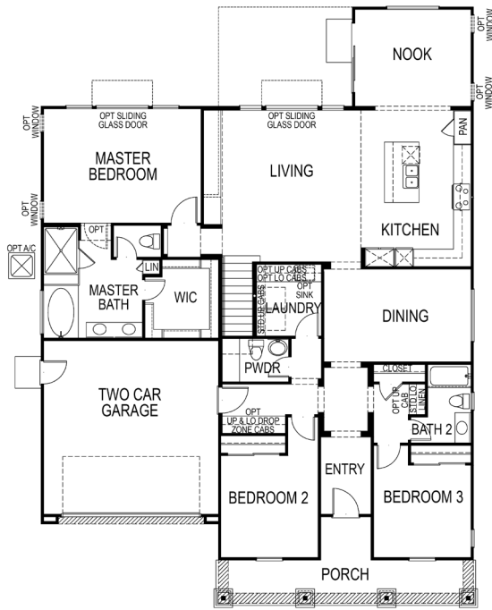
CRAFTSMAN - B