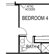
OPT BEDROOM 4/ BATH 4 @ LOFT